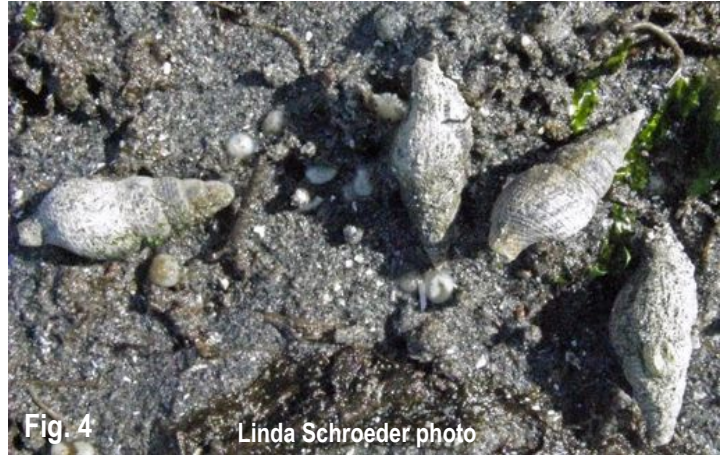
Fig. 4

Although I frequent Birch Bay several times a year, I realized the reason I had never stumbled across the Ophiidermella before was their location. This time I just happened to be on the very last sand bar not yet submerged by the incoming tide, which is at the western end of the beach. Normally I would have started walking back toward the State Park by that time. This sand bar becomes completely surrounded by water before it submerges so a person would tend to be back on the main beach by the time the snails were popping up out of the sand. I was much later coming back this time and was in the right place at the right time. I walked along the rest of the exposed sand and through shallow water and only found the snails along one