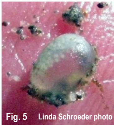
Fig. 5