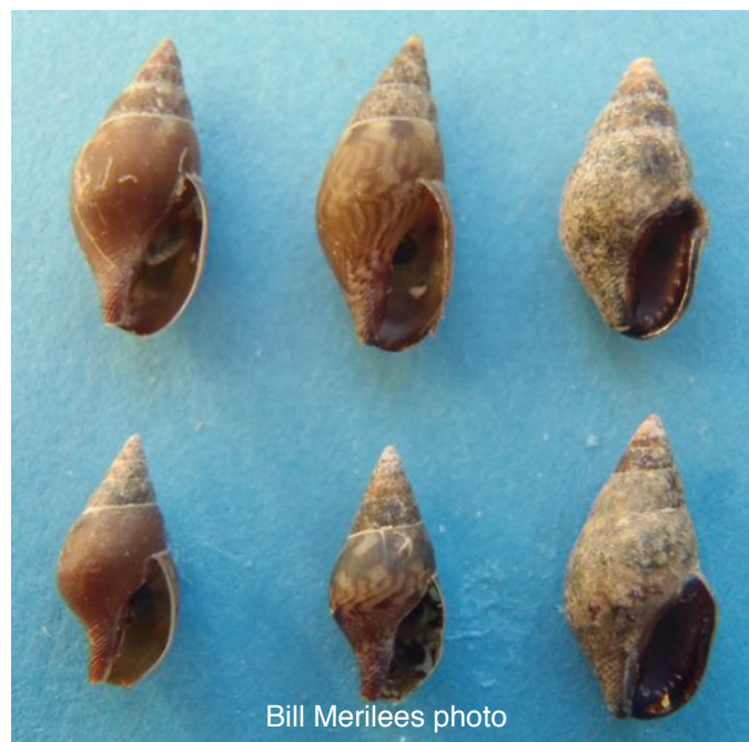
Fig. 2 - Intertidal scraping, 16-119 Cygnet Cove, Ucluelet, B.C., July 22, 2016. Varieties, forms, shapes and colour patterns.

Turpen's intertidal sample, the one most comparable to the Ucluelet collections, showed significant differences from those in the other habitats he sampled. The intertidal sample he states, "were generally tall and narrow, and often lacked the shoulder carina". He further cited a study by Bergman et al, (1983), where only 9% of Alia carinata from exposed environments were strongly keeled. No mention is made by Turpen, regarding the thickness of the aperture lip, nor the presence of denticles. He also noted that for some gastropods, "wave exposure is correlated with the presence of large apertures". Though speculative, he postulated that individuals